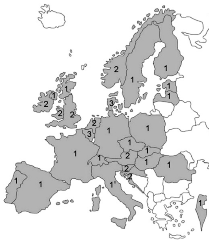
Figure 2 Map of Europe (+Israel): the number in each country represents the number of experts participating in the expert panel.

These results are remarkable, since they were already achieved after the first of two rounds of scoring. And what is more, the expert panel consisted of experts from 24 different countries all over Europe and Israel (figure 2).